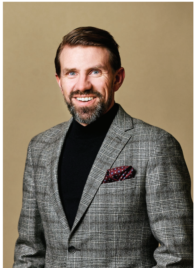
Paul Stormoen CEO of OX2

The way we act determines who we are and how we are perceived. We are resolved to act with professionalism and integrity in everything we do. Our Code of Conduct is part of OX2's foundation and how we operate. It represents what we stand for and functions as a roadmap for doing business the right way and guides us in our everyday work. Conducting business ethically, with integrity and transparency, is vital and I expect everyone working within OX2 to follow and comply with this Code of Conduct and I want all of our stakeholders to know about it.