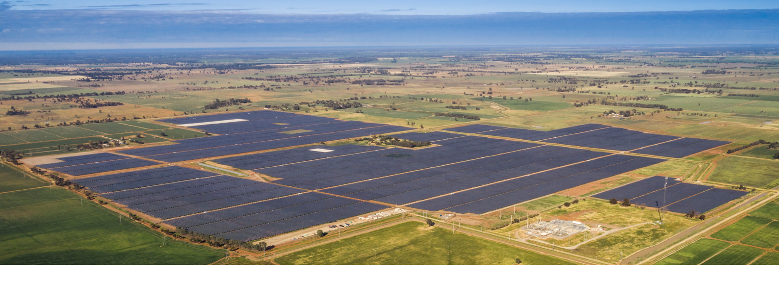
Finley Solar Farm, NSW