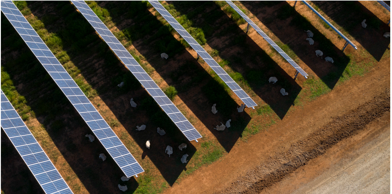
Finley Solar Farm, NSW